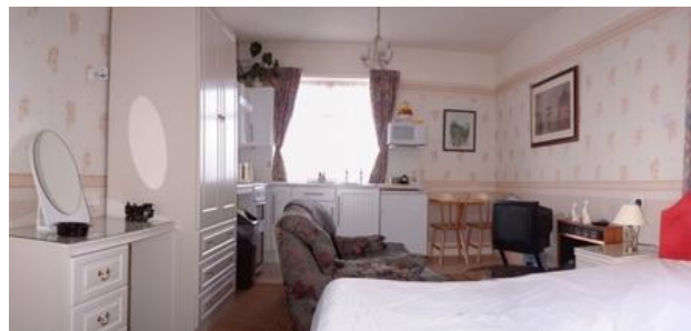
Even the smallest flat has space for a full-sized bed (Flat 6)