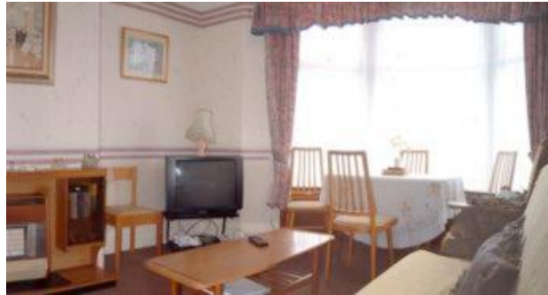
Lounges are spacious and attractively decorated (Flat 5)