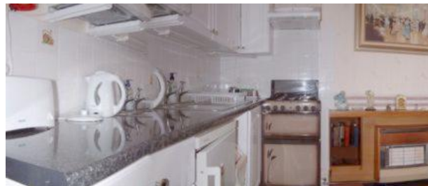
Kitchens are fully equipped and are sited in the lounge (Flat 1)